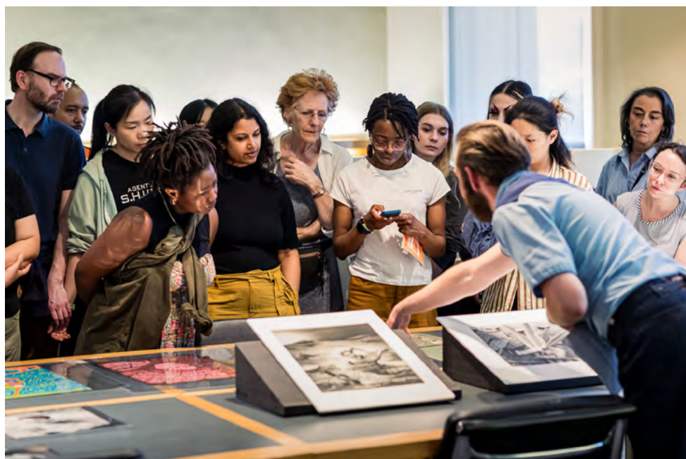
Prints and Drawings Study Room, V&A South Kensington

Researchers and the wider public can request to view artworks and objects from the collection in the Prints and Drawings Study Room at V&A South Kensington. Since 2010, this free service has received over 45,000 visitors, making the collection widely accessible for future and current audiences to explore, enjoy, and be inspired by. Accessibility to the collection has been further enhanced by the opening of V&A East Storehouse in May 2025. This unique museum experience provides unprecedented levels of access and engagement with the V&A's collection, particularly through the 'Order an Object' service which invites visitors to select objects which are not on public display and view them up close. Together, these are extraordinary resources for the exploration, research, and enjoyment of works acquired through the Global Africa Acquisition Groups support.