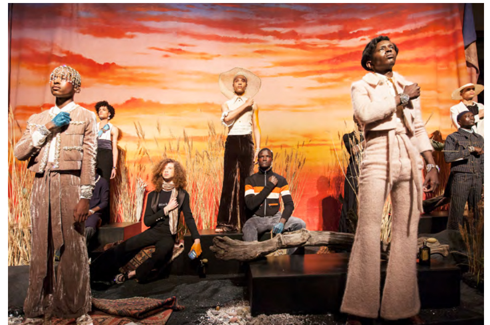
Grace Wales Bonner , Fashion in Motion Event , V&A South Kensington

“Early in my career I was given the opportunity to showcase my work at the V&A and have felt the support of the institution since then. I am very glad they have renewed their commitment to the collection and stewardship of works from Africa and the diaspora.” Fashion Designer and Hermès Creative Director of Menswear, Grace Wales Bonner