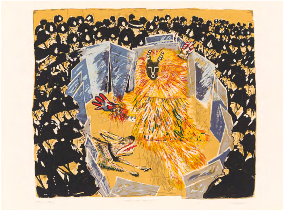
Tam Joseph, Spirit of the Carnival , 1988

CAF payments, or payments from your charitable trust or foundation can be accepted for your donation.