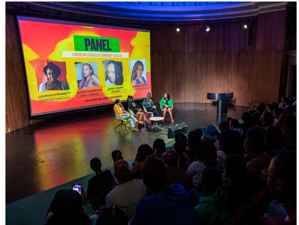
V&A Friday Late x GUAP, London Is The Place For Me?, panel discussion

The Global Africa Acquisition Group meets with the curators annually to view potential acquisitions and discuss which works are to be acquired for the permanent collection, gaining an in-depth, personal understanding of the V&A's engagement with objects from Africa and the diaspora. In addition, members of the group are invited to many other wonderful opportunities which demonstrate the impact of their generosity, joining curators at exclusive object-handling and behind-the-scenes museum events, artist, designer and maker studio visits, private views and curator tours, and art fairs and festivals both in the UK and abroad.