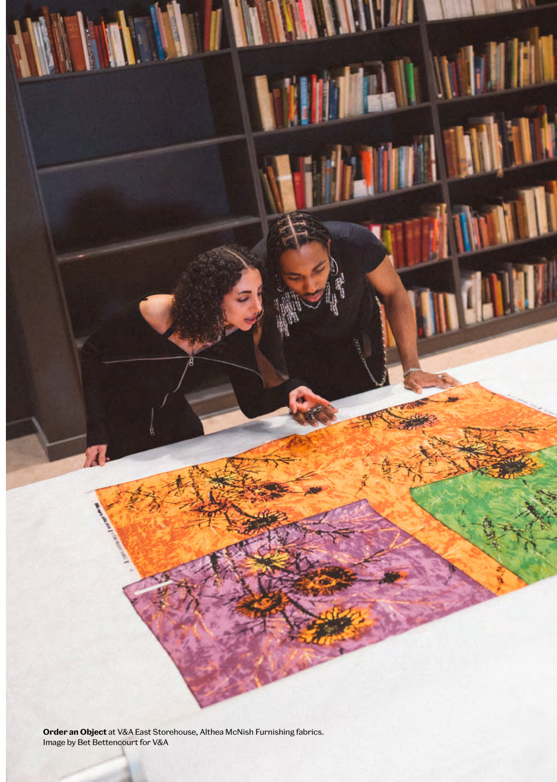
Order an Object at V&A East Storehouse, Althea McNish Furnishing fabrics.