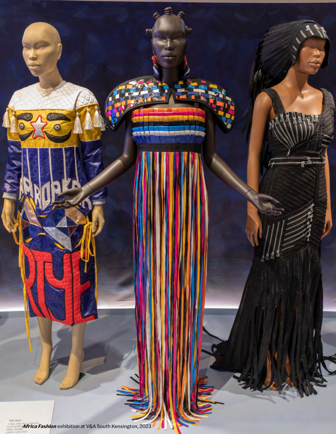
Africa Fashion exhibition at V&A South Kensington, 2023