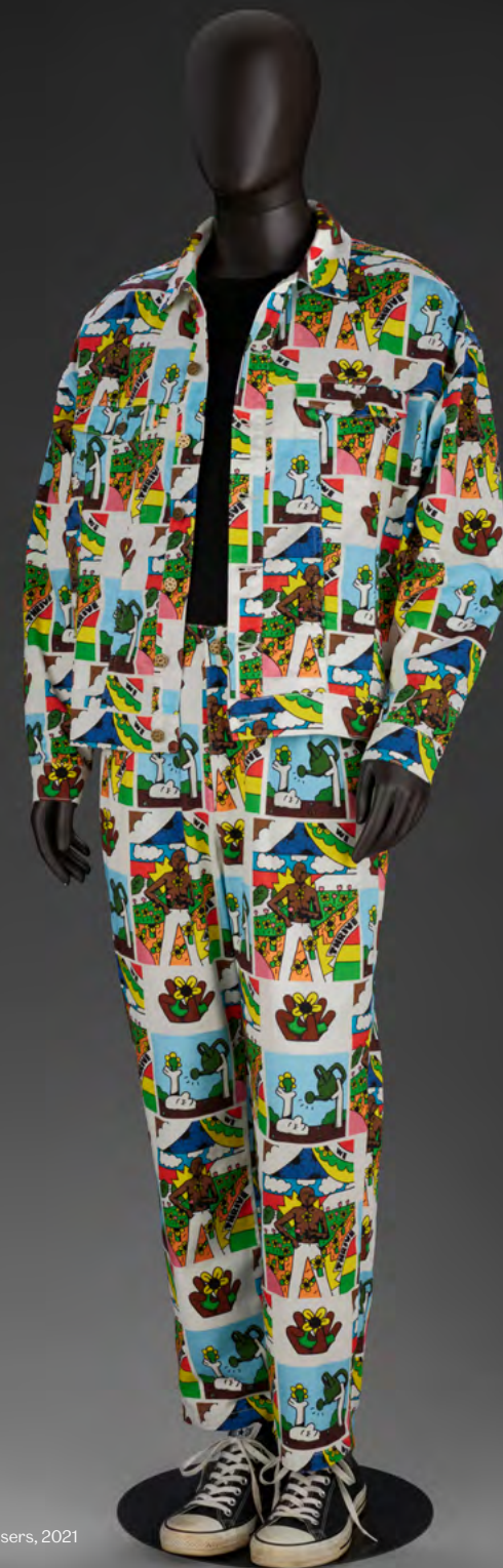
King Owusu x Lazy Oaf Printed denim jacket and trousers, 2021